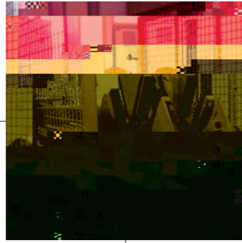
Star-shaped turning device