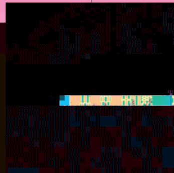
1 Grinding machine